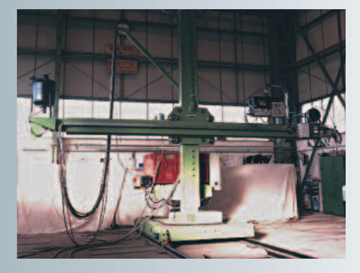
Model 3/TRMB 4 m x 5 m Tracked unit with rotating column.

Model 3/TRMB 5 m x 4 m Set-up for seamless pipe welding using submerged arc welding unit.