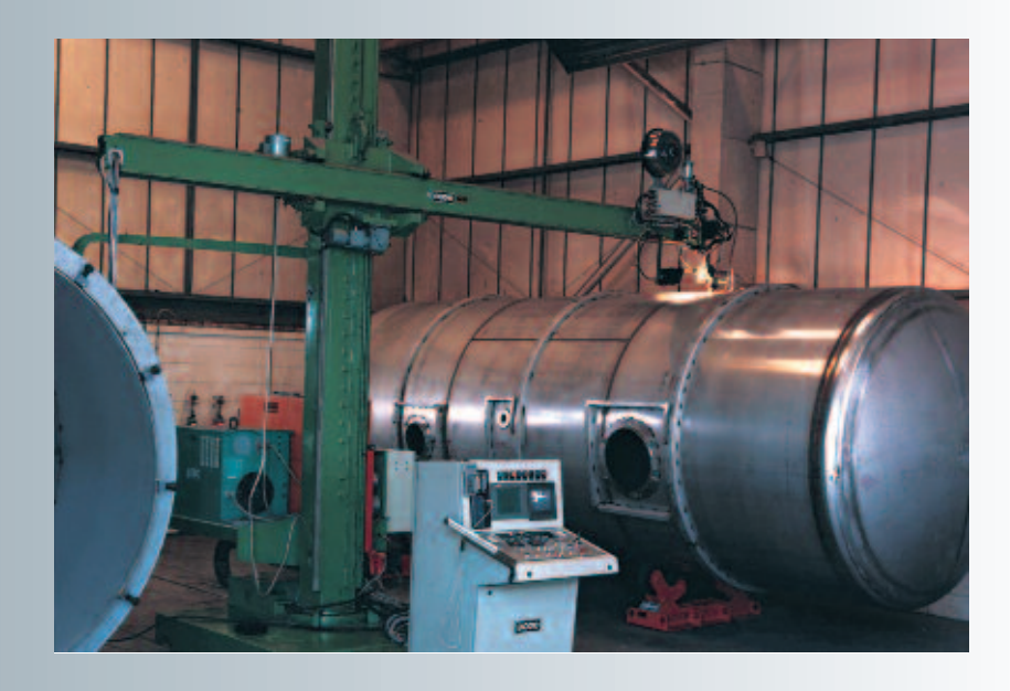
Model 3/TRMB Utilised as shown in stainless steel container welding role. Container carried on Bode SAR 1200 Rotators. Remote control master station.